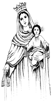
Our Lady of Mount Carmel